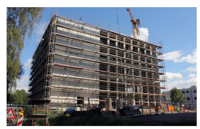
The new building in September 2013

In only one year, the Departments of Mechanical Engineering and Electrical Engineering and Information Technology will move into this new 2500 square-meter building.