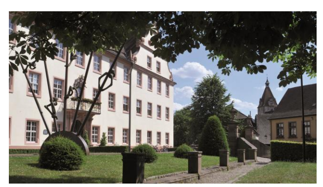
Offenburg University building in Gengenbach

We just received notice that IBC has been ranked by QS (Quacquarelli Symonds, one of the three most influential university rankings in the world, which also runs a number of well-known MBA-related events), in the category of "Emerging Regional" programs.