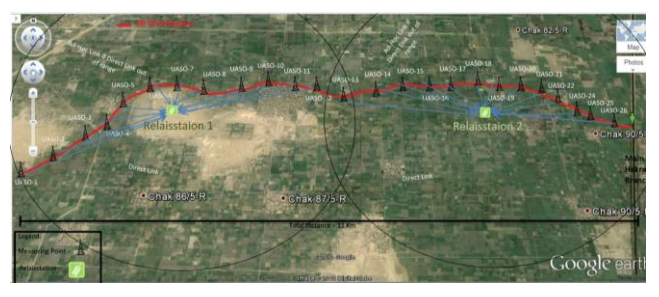
Sensor Network for monitoring the irrigation system in Pakistan

Offenburg University in collaboration with the School of Science and Engineering at the renowned Lahore University of Management Sciences (LUMS) has established a German-Pakistani research project.